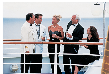
Come cruise with us and enjoy many private wine tastings, dinners, and spectacular views from around the world.